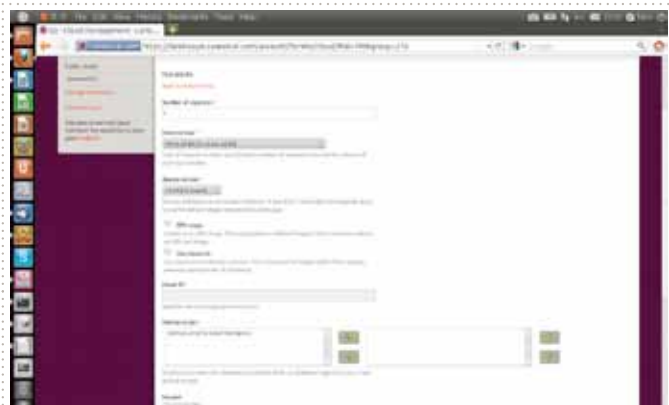
Creating new instances